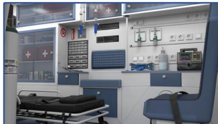
Wall mount-type medicine cabinet