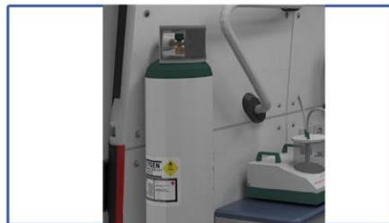
Oxygen tank for medication