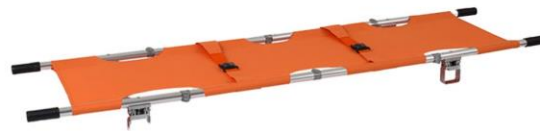
Sub stretcher (Standard specifications)