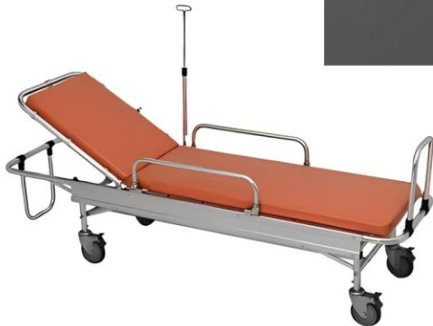
Fixed type main stretcher (Standard specifications)