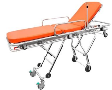
Link type mail stretcher (Optional)