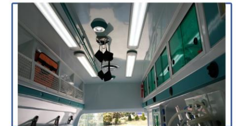
Adjustable light, LED lamp and ventilation